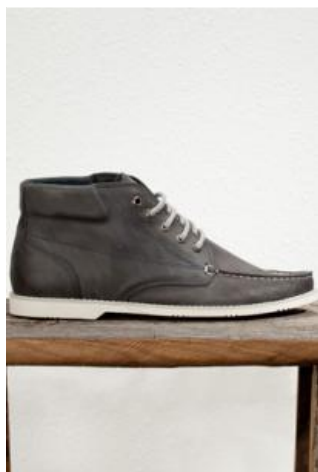
Pull & Bear

In part two of our footwear and accessories key item analysis, we examine the soft accessories, jewellery and eyewear trends that will drive the season ahead.