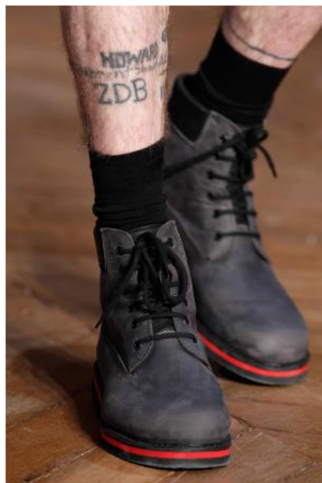
Adam Kimmel spring/summer 2012