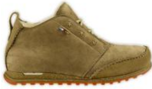
The North Face