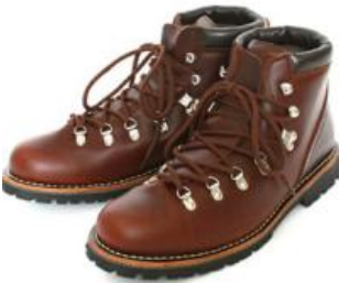
Green Label Relaxing