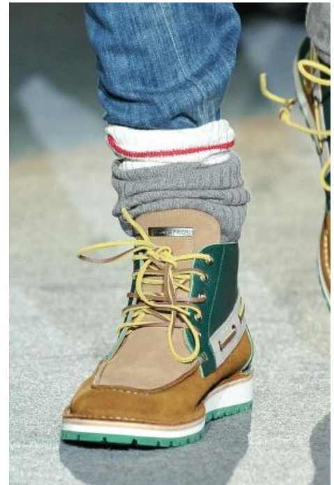
DSquared spring/summer 2012