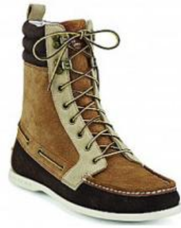
Band of Outsiders