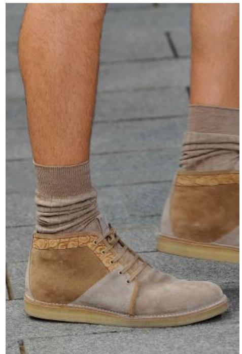
Louis Vuitton spring/summer 2012

Classic work boots are modernised with contrast laces and stitching in bright green and red against black. A two-tone sole updates the standard camel suede style.