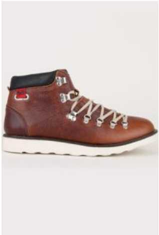
Beck & Hersey