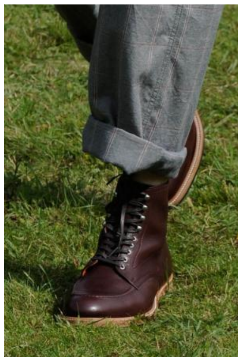
Junya Watanabe spring/summer 2012