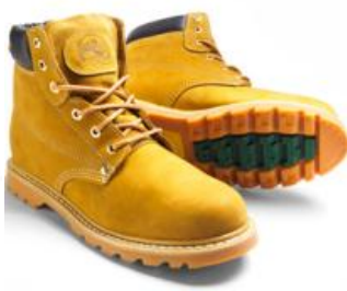
Flintoff by Jacamo