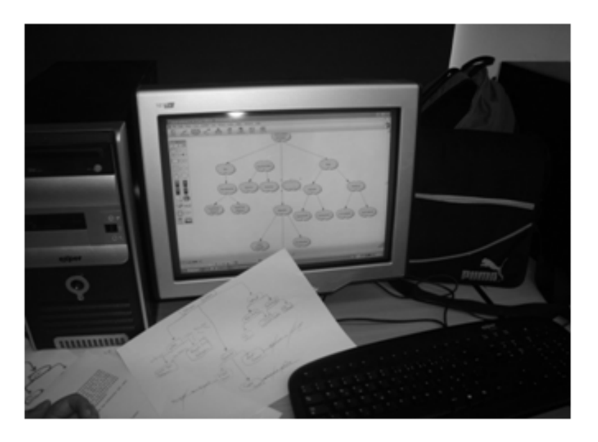
Fig. 3. Technology-supported concept mapping